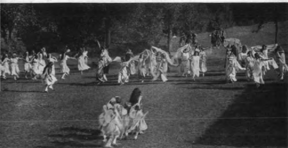
THETFORD PAGEANT, 1911