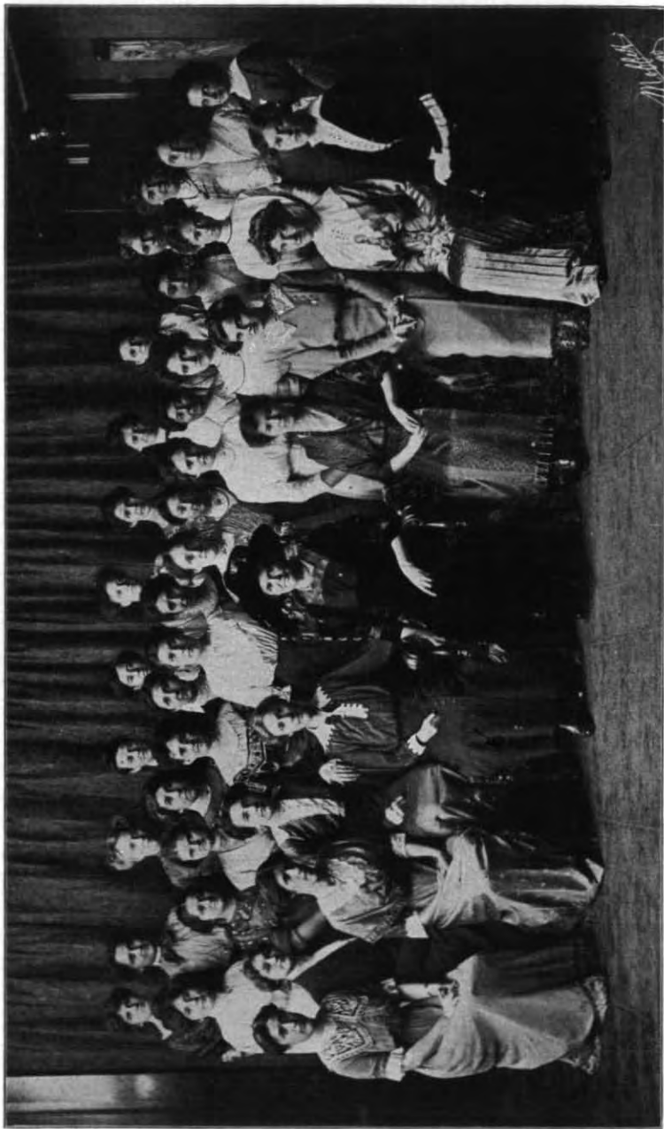
NATIONAL PAN-HELLENIC CONGRESS, 1912