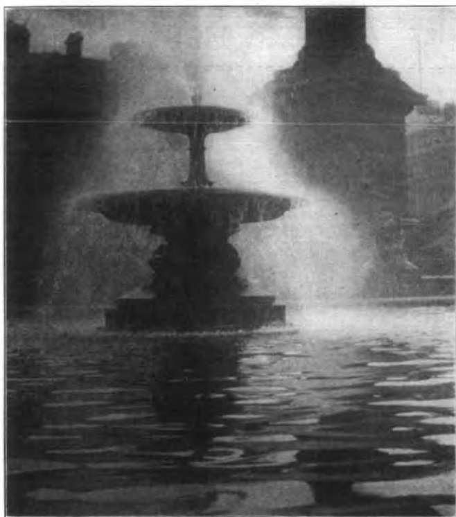
TRAFALGAR SQUARE, LONDON

a half-hearted way, is sure to prove uninteresting and unsuccessful. But, on the other hand, the question, vital to the race arises: Would a woman satisfied with her own endeavor feel less the need of expression through children? If statistics would seem to show that the professional woman defers marriage, it is not so much because of her lack of mother instinct as because of her advanced standard for