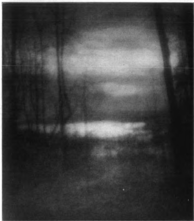
MARSH—EARLY MORNING by Imogen Cunningham

for its own sake is narrow and one surely cannot derive from it that aesthetic pleasure which comes from finding beauty in the commonest things. Accomplishments in any art are all a matter of gradual