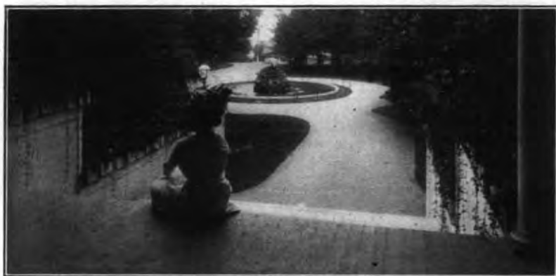
THE INN FROM THE STATION

Detroit will be the meeting place for the eastern delegations with \Pi \Phi headquarters at the Statler Hotel. Arrangements for a