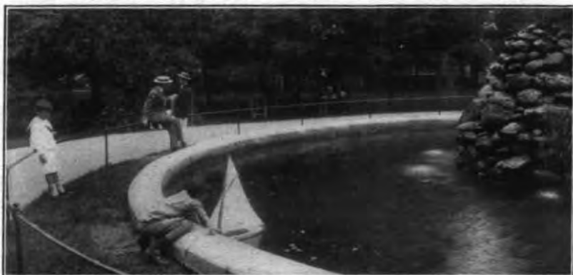
THE POOL AT CHARLEVOIX

The government has not definitely fixed the summer tourist rates so it is impossible to publish them here. Apply to any of the representatives mentioned above or ask your local ticket agent to secure for you the rate to Charlevoix and return, including the war tax.