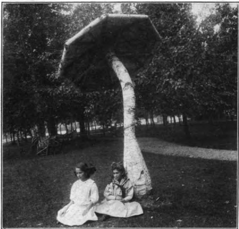
MUSHROOMS, AT CHARLEVOIX-THE-BEAUTIFUL

harbor. "The Inn" with its many verandas is attractive to approach and on entering one finds a cozy homelike lobby with scores of easy chairs. To the right is a charming dining-room, which should be a favorite meeting place for us all. This large rectangular room where all can see and hear should be ideal for our banquet which will be the climax of our happy days together.