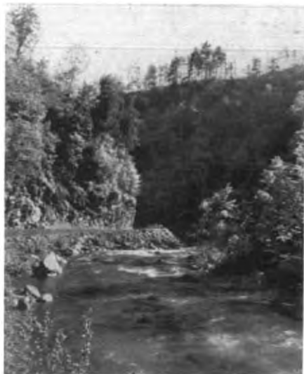
FROM HILLS LIKE THESE CAME THE CHRISTMAS DECORATIONS.*