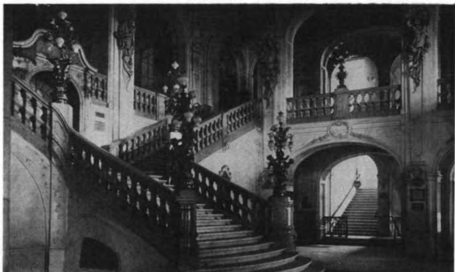
THE CELEBRATED BAROQUE STAIRWAY IN THE OPERA HOUSE AT GRAZ, SECOND LARGEST CITY IN AUSTRIA