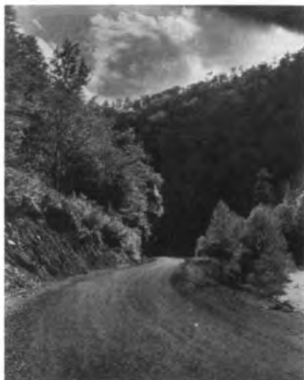
A BIT OF THE NATIONAL PARK HIGHWAY SYSTEM.*

The decorations were as lovely as the mountains from which they came. The natural arrangement of the holly and dogwood berries, of the mistletoe and galax leaves showed the students how to use what the Lord has given them.