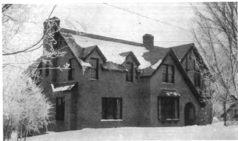
VERMONT BETA'S NEW CHAPTER HOUSE

This room has a composition flooring in maroon color, a splendid brick fireplace, and a closet with double doors for fraternity archives and paraphernalia. It is furnished with wicker furniture and made informal and cozy with warm-colored cretonne. From the main hall of the basement, a smaller hall opens at right angles.