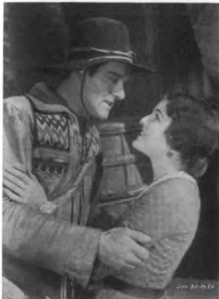
Still from the German version of "The Big Trail," a great hit in Germany and Austria.