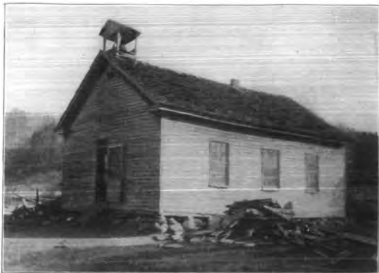
SCHOOL BUILDING USED BY PI BETA PHI: AUGUST 1912, 1913, 1914

woman upon being delivered of her first child, the previous tortuous four hours were entirely forgotten for the moment, and my soul was spurred to ecstatic adoration and sympathy for the place.