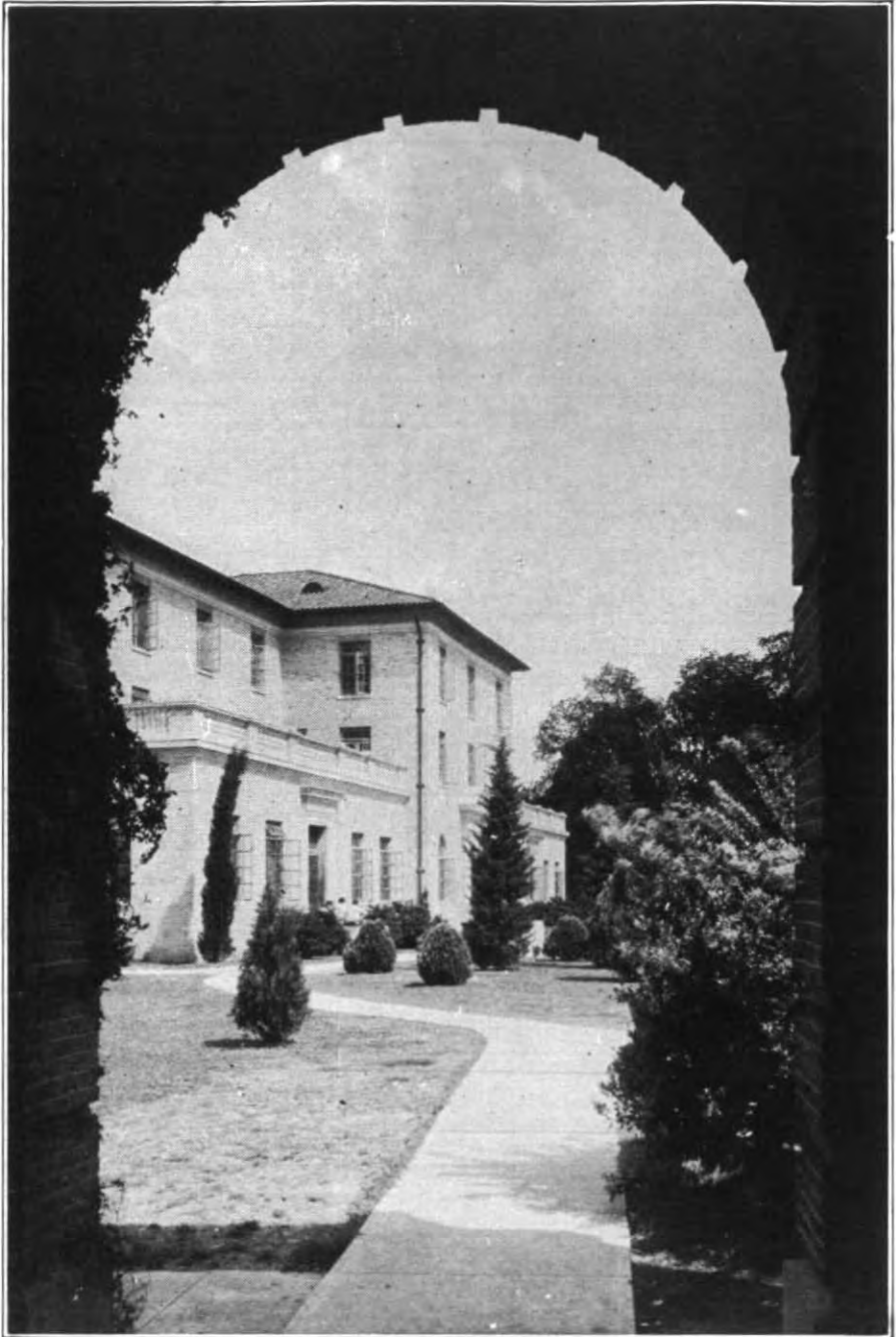
FIELD HOUSE AND RECREATION CENTER, LOUISIANA STATE UNIVERSITY, BATON ROUGE