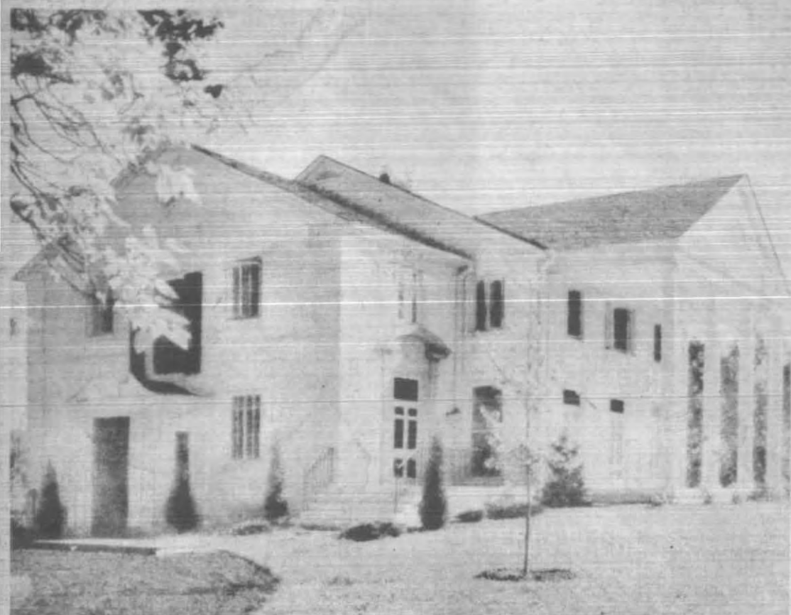
NEW INDIANA GAMMA HOUSE, BUTLER UNIVERSITY