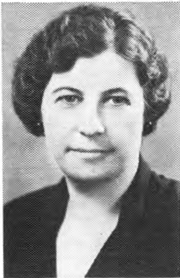
The Helen Clark School of Secretarial Training which opened in Topeka, Kansas,

in January 1932, is the first private school for girls to give training for secretarial work in that section of the country. The major portion of the students are girls with a college degree who have come to the Helen Clark School for the practical and cultural training required for interesting positions in secretarial work.