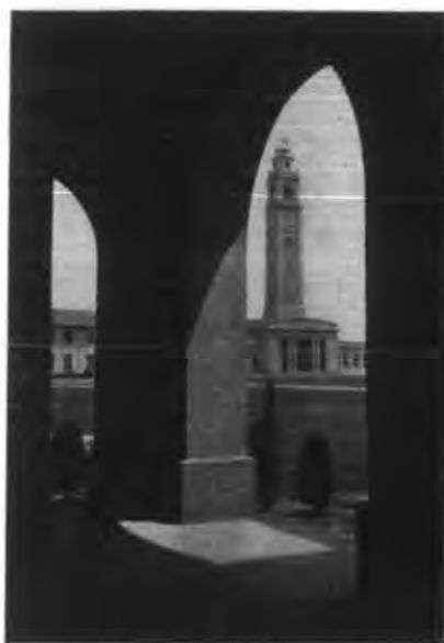
WAR MEMORIAL TOWER

Gifts, flowers, and wires were showered upon the new chapter from local sororities, alumnae clubs, alumnae, and from Pi Phi