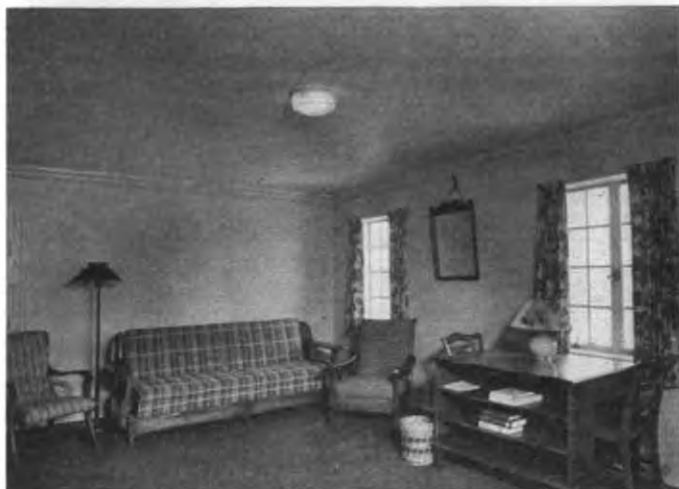
LIVING ROOM (TOP) AND TOWN GIRLS' ROOM IN THE INDIANA GAMMA CHAPTER HOUSE