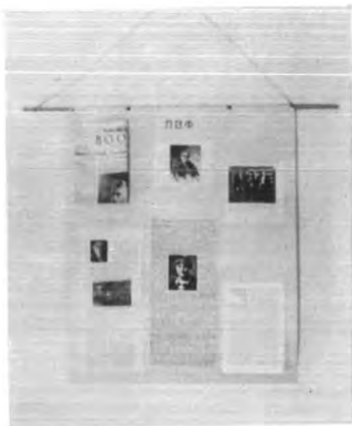
PI PHI EXHIBIT

Just as thousands of New Yorkers jammed the Book Fair held in Radio City last December, so did members of sororities rush to see the special book exhibit conducted by the New York Panhellenic Club.