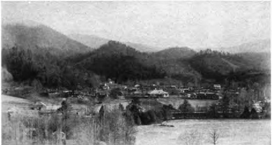
PI BETA PHI SETTLEMENT SCHOOL

My first impression of the mountains was that they were bewilderingly beautiful and fascinating. The mountain people were at first reserved, but when you were once accepted as being friendly, they gave their confidence freely and asked many novel and shrewd questions. In later visits, I have found that the children are lovable, very intelligent,