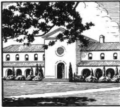
DRAWINGS OF THE L.S.U. CAFETERIA

THE week-end of October 16 was a joyous and a memorable one for Louisiana Pi Phis, who had long looked forward to the installation of our eightieth chapter as Louisiana Beta at Louisiana State University in Baton Rouge. A round of parties, teas,