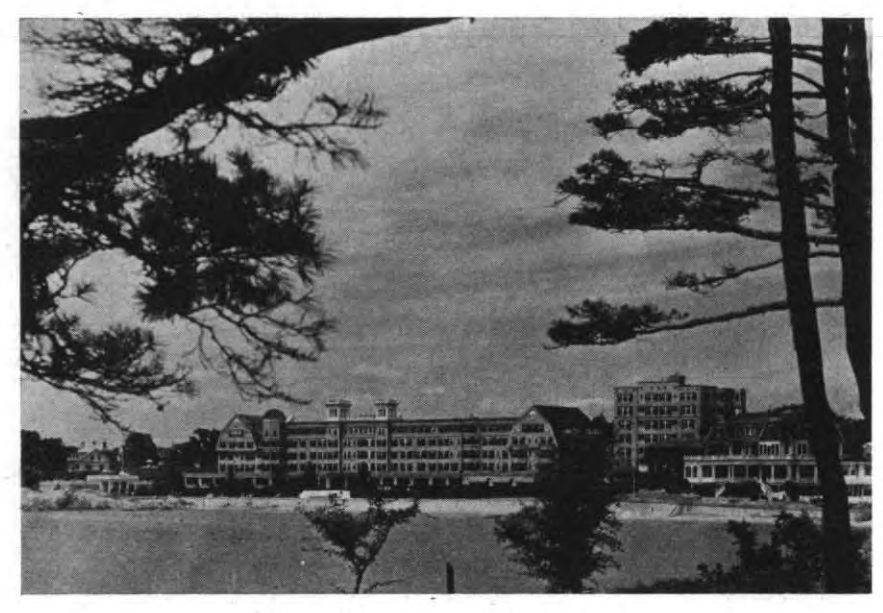
New Ocean House and Cottages

Grand Council announces that Convention will be held the week of June 23rd, 1946 at the New Ocean House, Swampscott, Massachusetts.