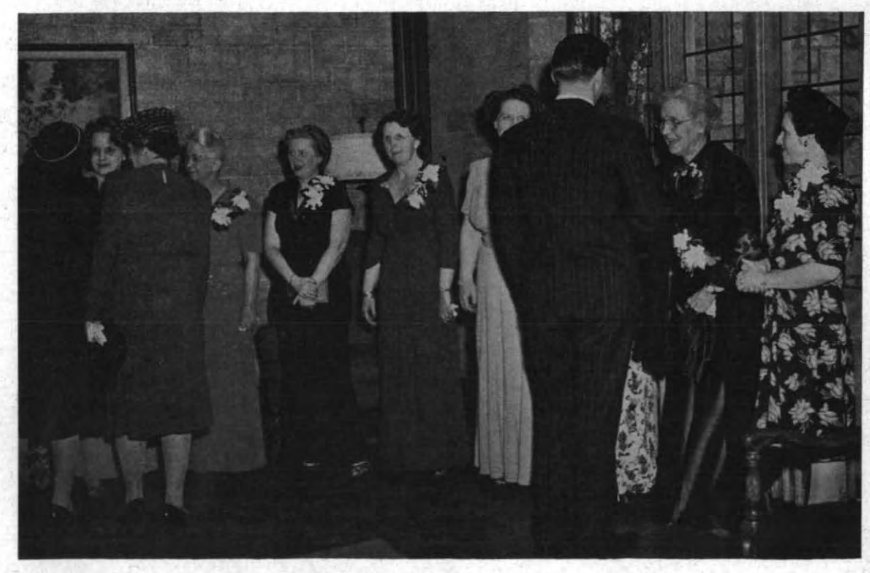
Receiving line and guests at reception.