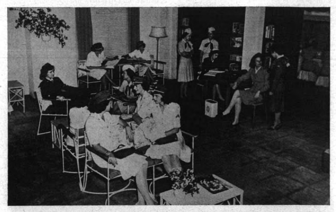
Enlisted Women's Lounge, Honolulu U.S.O., Panbellenic Project