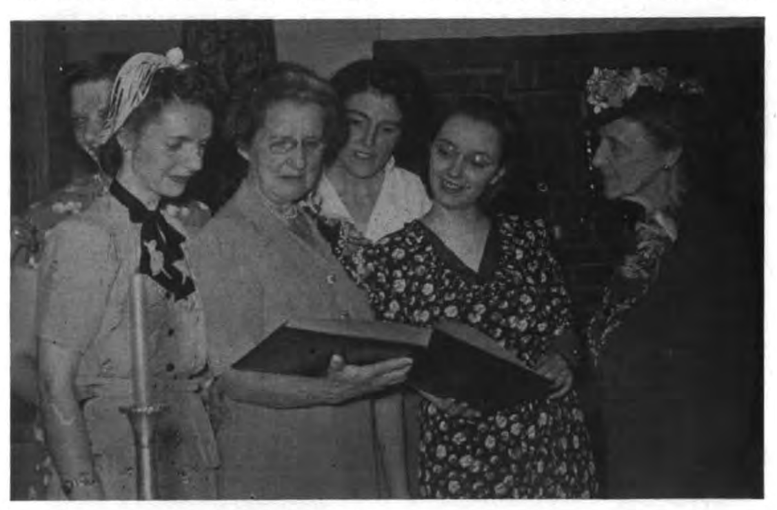
Maryland A-Baltimore Alumnæ Club-Founders' Day Banquet-April 24, 1945

The only disappointment of the beautiful Founders'