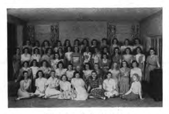
Wyoming Alpha, 1944-45

rushees a glimpse of the campus activities and advice as to what the well-dressed coed should wear. That old pre-war spirit is being dusted off by a heavy enrollment of students, a generous amount of whom are war veterans.