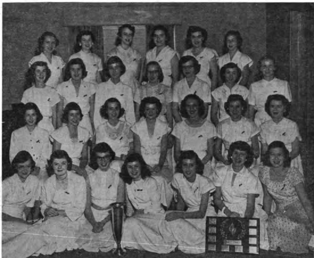
Here's Iowa B—Nominee of Stoolman Vase 1949-50; National Scholarship plaque, 1949-50; first in Scholarship on their campus for the eighth time.