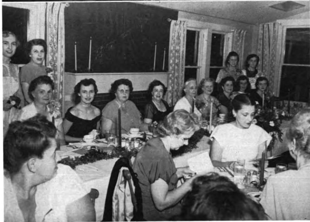
West Virginia Beta at Installation The Installation Banquet