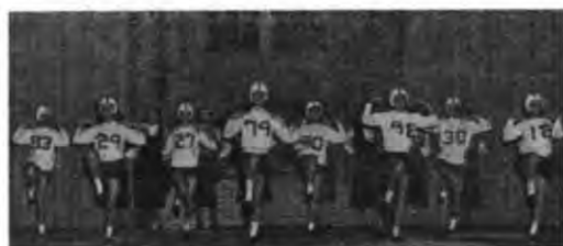
Missouri Beta Skit in Bearskin Follies—called "Feet in the Footlights." It was one of ten skits chosen for the show.