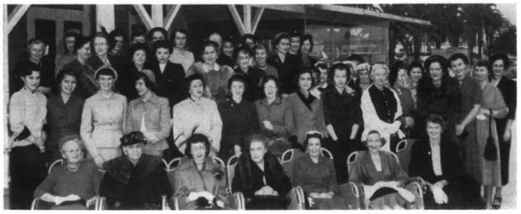
Picture taken at the annual Christmas luncheon of the San Diego Alumnæ Club held at the San Diego Yacht Club in honor of actives and pledges from various colleges who were home for Christmas.