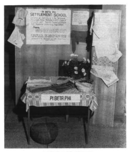
PI BETA PHI'S EXHIBIT

Tennessee and food and clothing for needy babies in same area