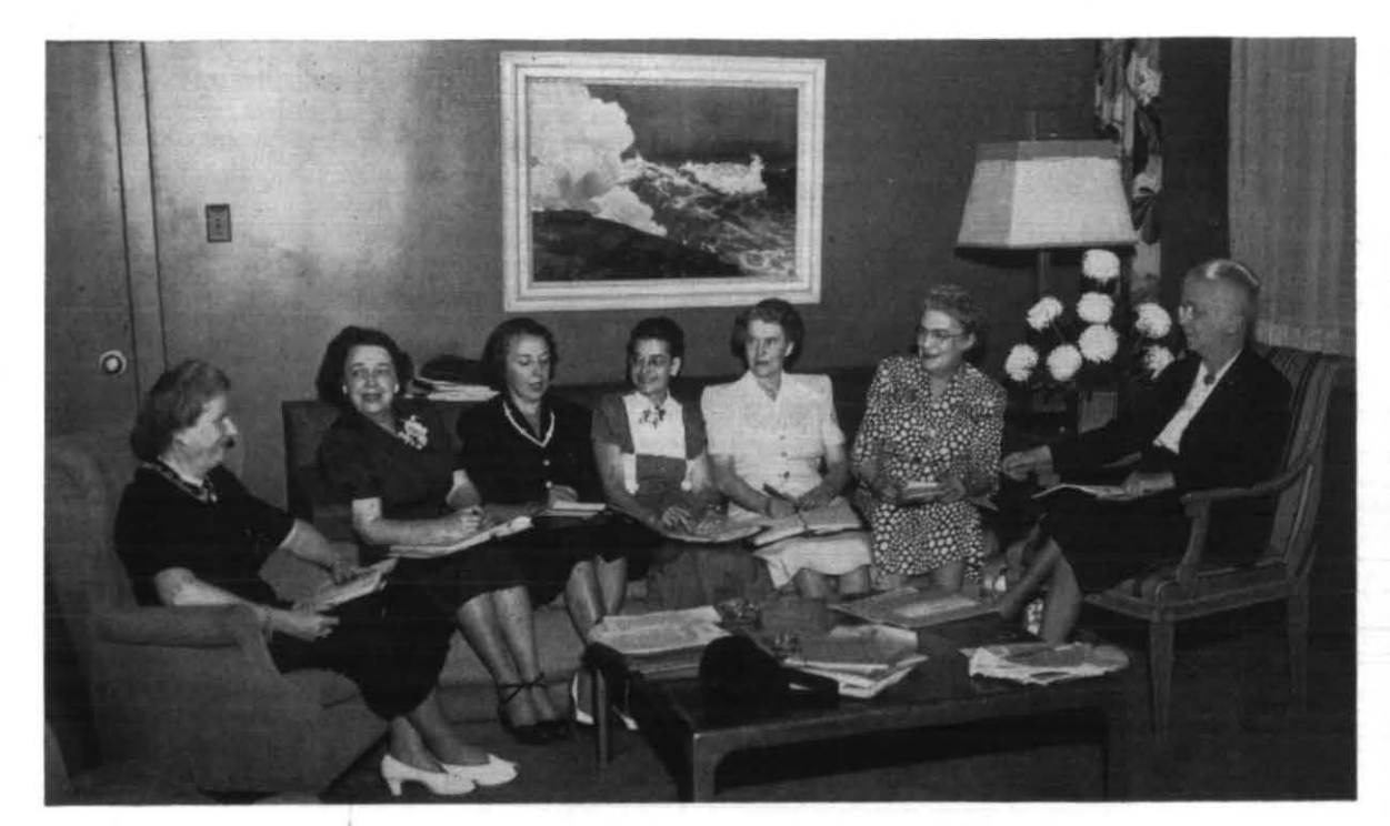
Past Grand Council at Preconvention Meeting—June '52