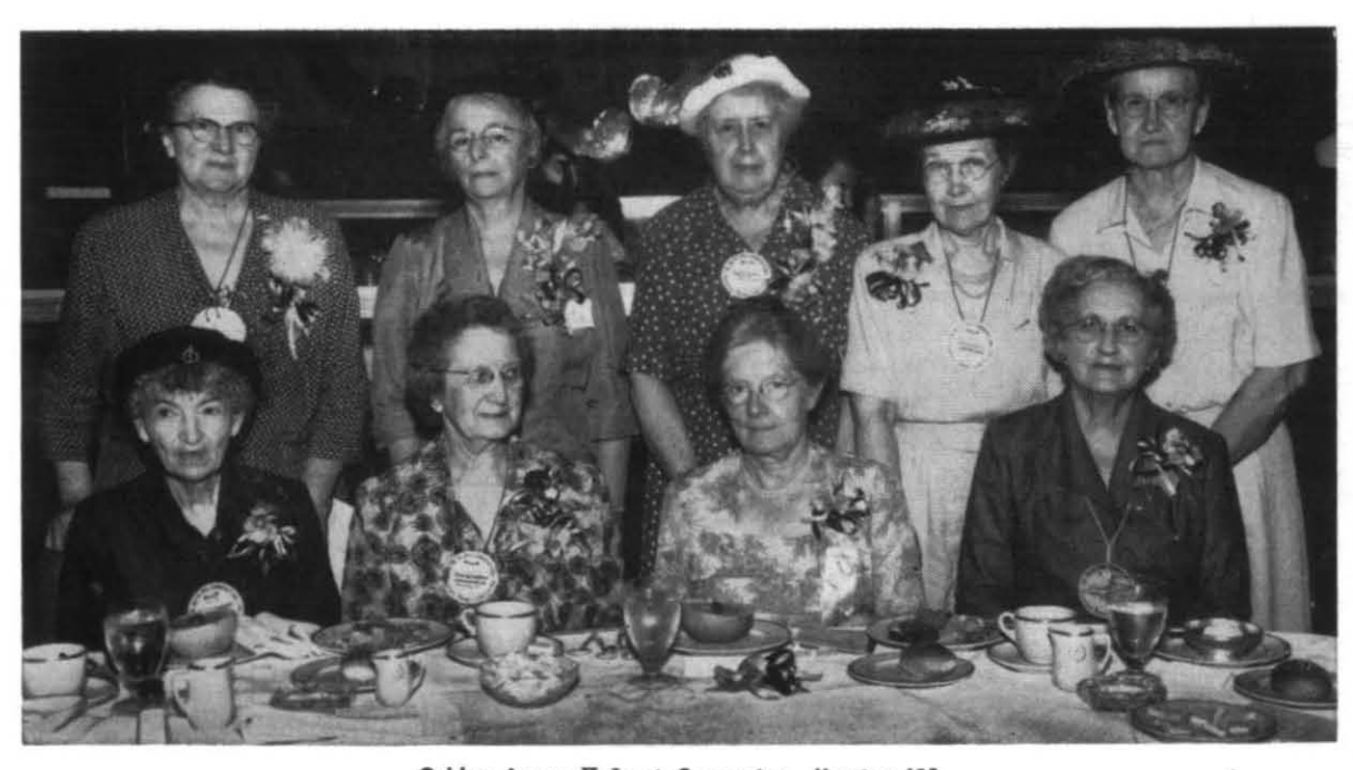
Golden Arrow II \Phi s at Convention—Houston '52