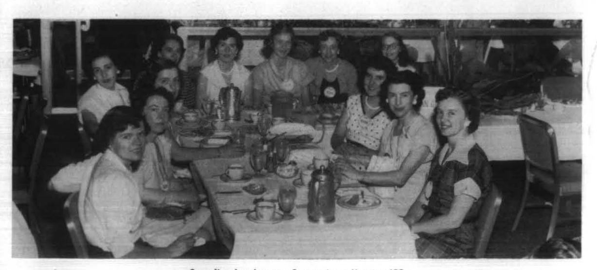
Canadian Luncheon at Convention—Houston '52