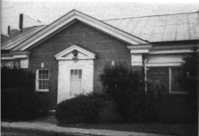
Π Β Φ House