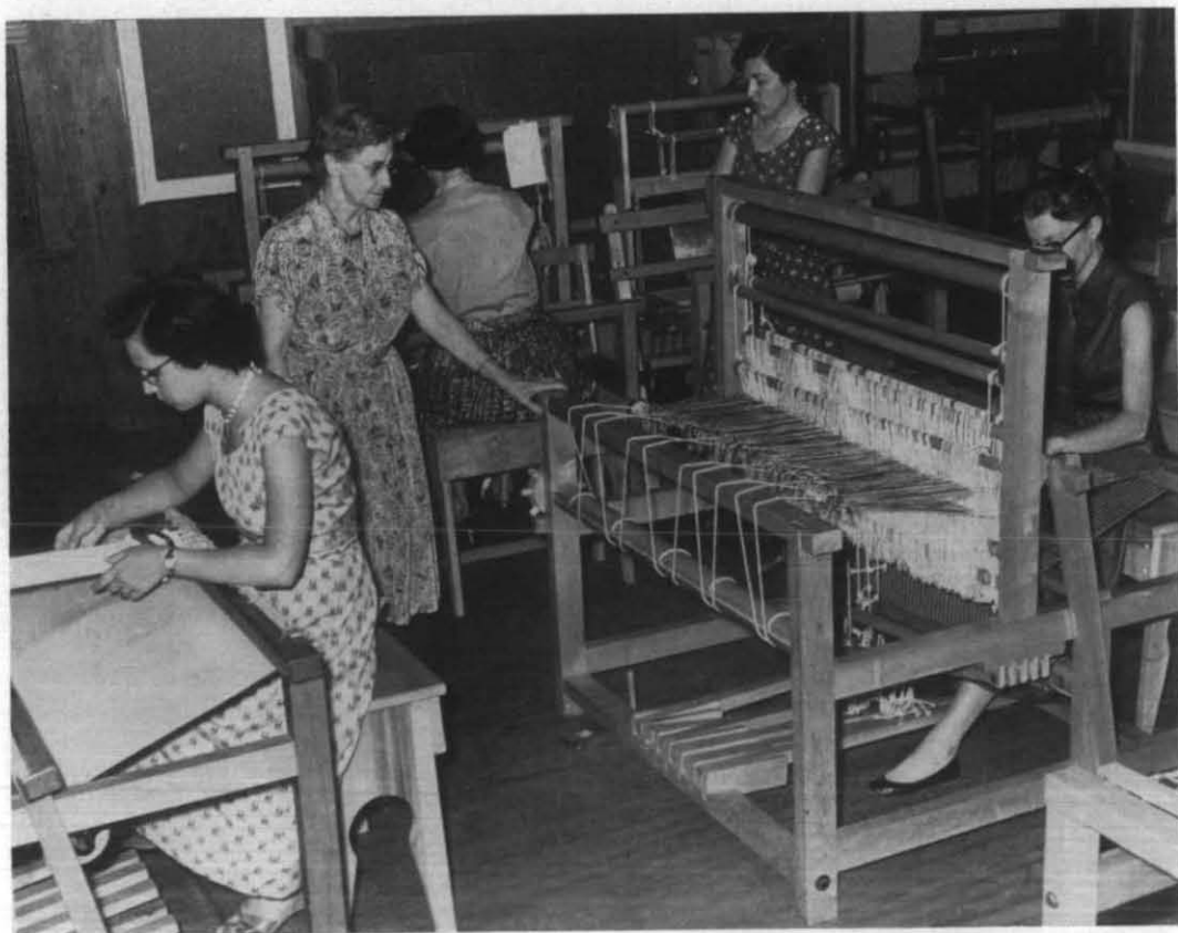
Weaving Class at Summer Craft Workshop

Last year Sevier County raised 6% of the funds for school operation in the County and the State contributed 94%. The proposed change in the allocation of funds for education to the various Counties will necessitate a curtailment of the program in the Sevier County schools or the raising of more money locally. The problem of dividing the funds will fall to the next legislature. The enrollment has increased which means more teachers are required. Is there any doubt that the Pi Beta Phi teachers are needed?