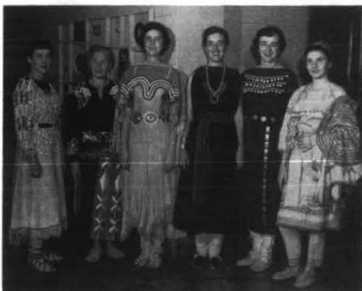
PI PHI MODELS. These authentic Indian clothes were worn at the Dallas Museum of Fine Arts in a preview of the Indian Fashion Show which featured the Dallas State Fair.