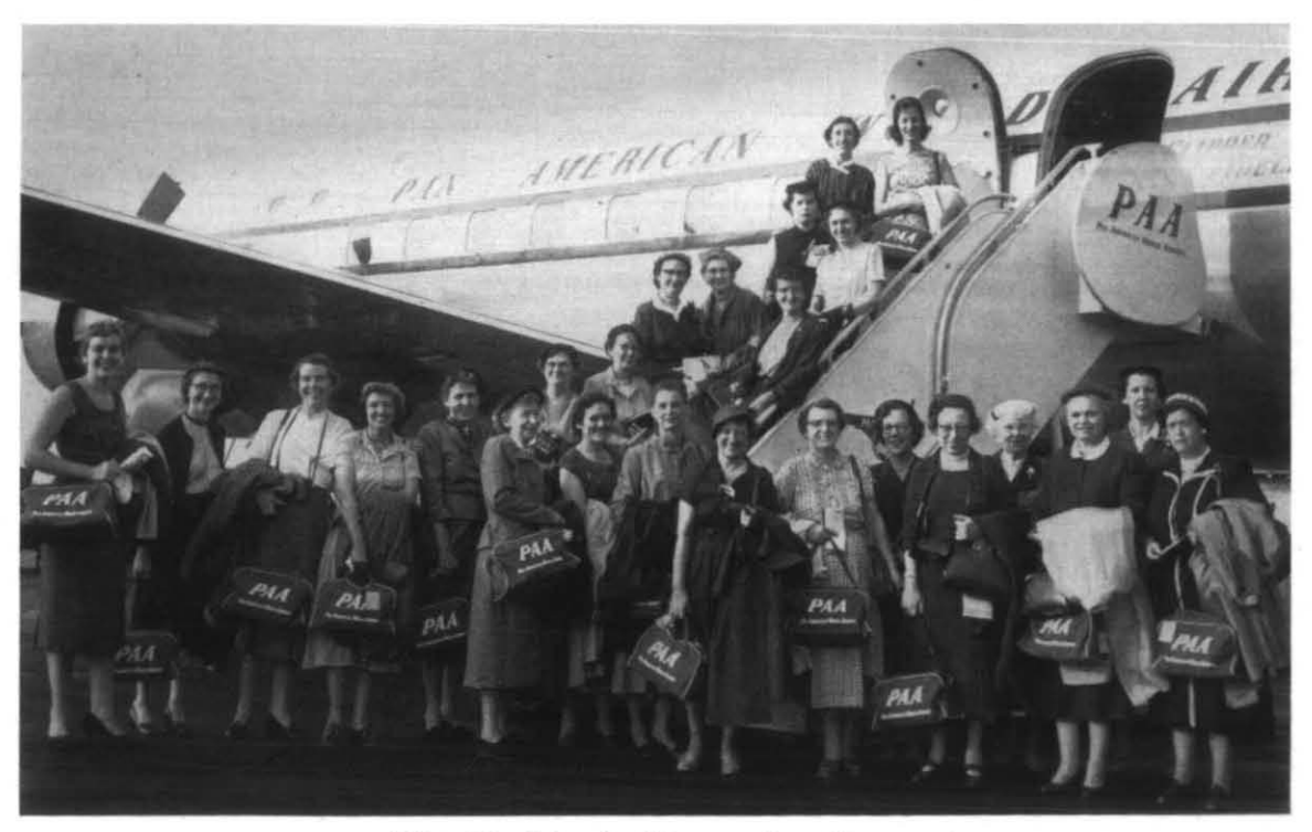
Pi Beta Phi-University of Tennessee Tour of Europe.

We saw well-known craftsmen at work, visited famous schools, museums, and craft factories, and studied craft organizations of each country. We had the opportunity of seeing one international exhibit