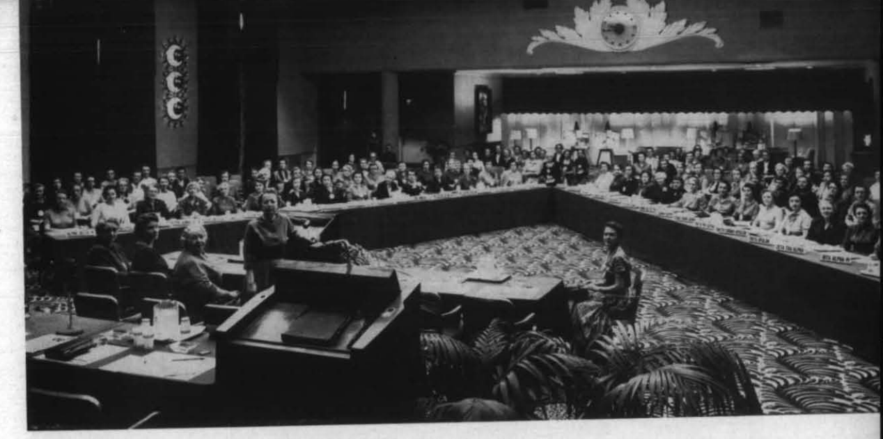
NPC CONFERENCE, NOVEMBER 14, 1956

Delegates at the V-shaped table are in the following order: Left leg of "V" from left—Alpha Delta Pi, Alpha Epsilon Phi, Alpha Gamma Delta, Alpha Omicron Pi, Alpha Phi, Alpha Sigma Alpha, Alpha Sigma Tau, Alpha Xi Delta, Beta Sigma Omicron, Chi Omega, Delta Delta Delta, Phi Epsilon, Delta Sigma Epsilon, Delta Zeta, Kappa Alpha Theta, Right leg of "V" from center—Kappa Delta, Kappa Kappa Gamma, Phi Mu, Phi Sigma Sigma, Pi Beta Phi, Pi Kappa Sigma, Sigma Delta Tau, Sigma Kappa, Sigma Sigma Sigma, Theta Phi Alpha, Theta Sigma Upsilon, Theta Upsilon, Zeta Tau Alpha, and lota Alpha Pi (associate). All the others are alternate delegates, members of the various national councils and editors and executive secretaries.