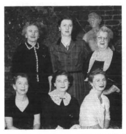
OLD AND NEW OFFICERS, EDITOR'S CONFERENCE

workmanship. She called attention to the value of reviewing and evaluating the National Panhellenic Conference and determining the course for the next biennium. She referred to these as "troublesome times when fraternities have been hurt by a hostile press and certain segments of the motion picture