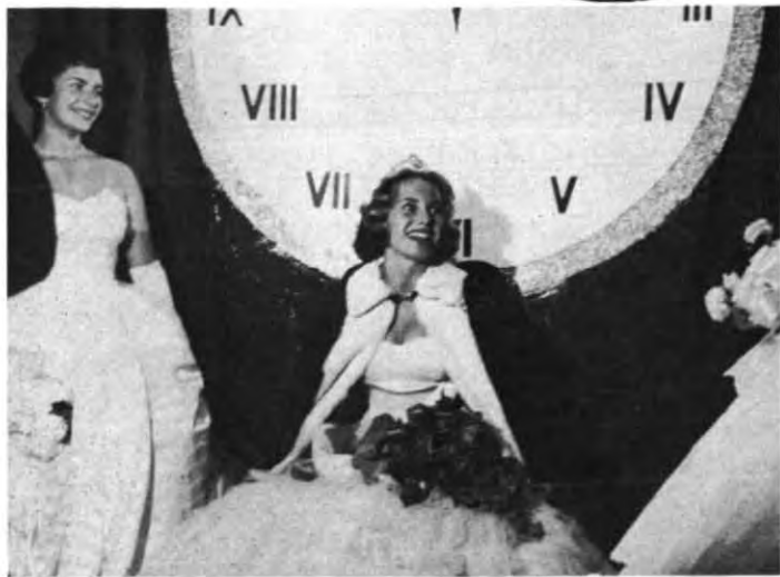
Coronation—An hour to remember.