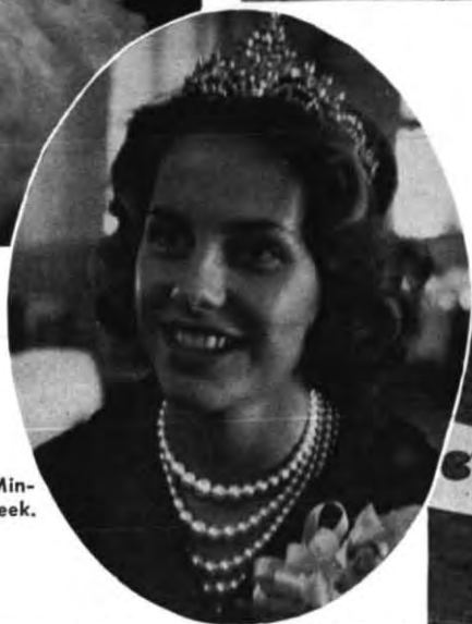
A royal hostess during Minnesota's Homecoming Week.