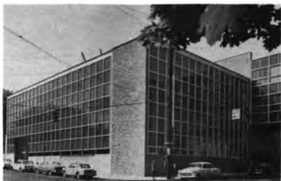
PORTLAND STATE'S NEW LIBRARY. It seats 700 and on separate levels has divisional libraries for the Humanities, Education, Social Science and Science.