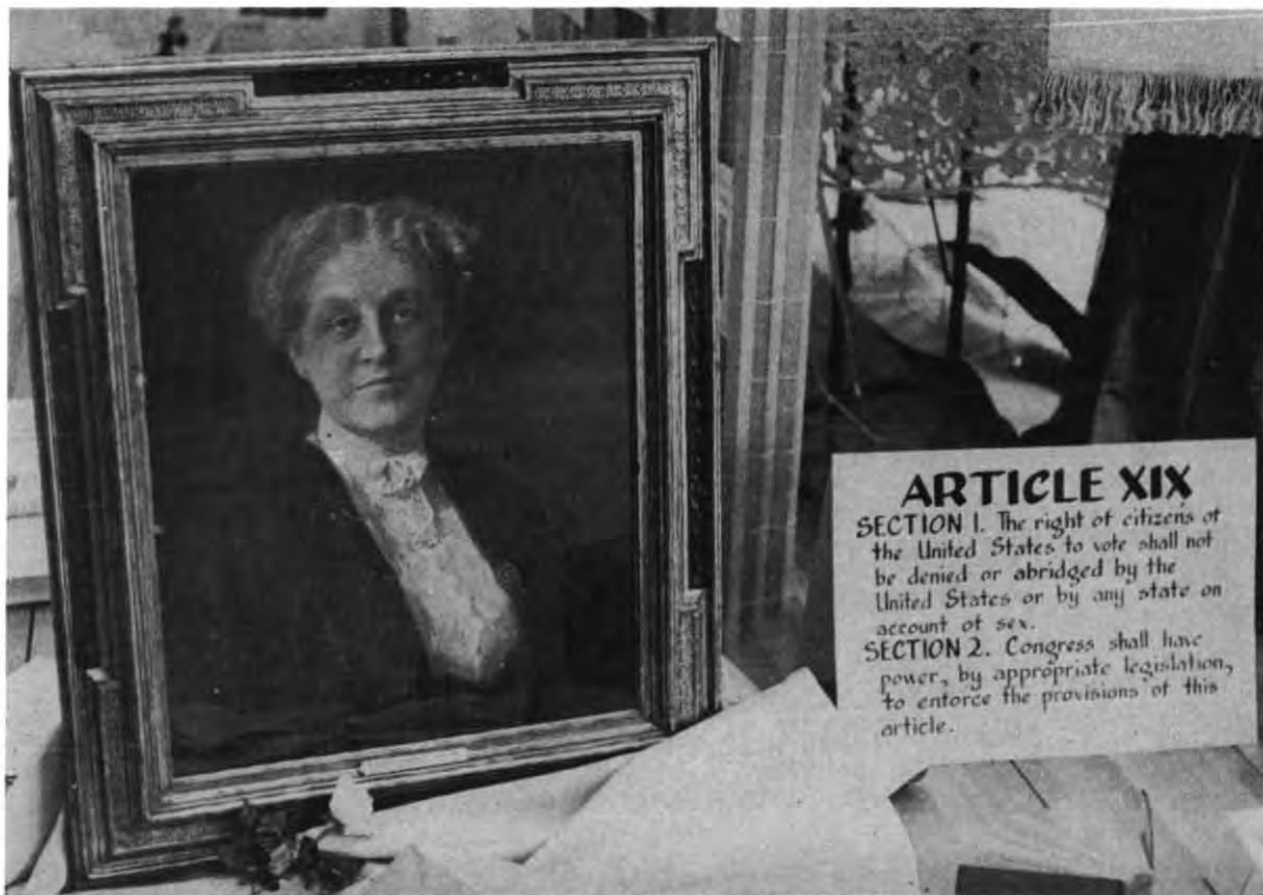
Portrait of Carrie Chapman Catt on display. She is wearing a jeweled international Suffrage pin. This pin was also on display.