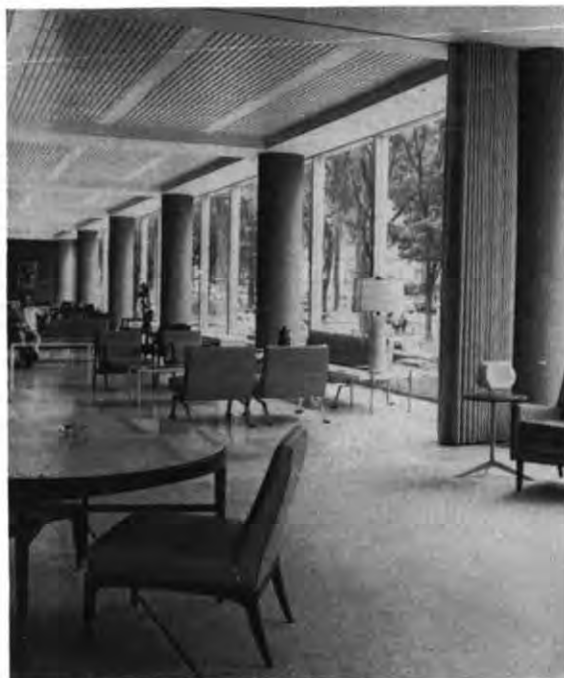
PORTLAND STATE COLLEGE STUDENT CENTER LOUNGE. Here the new chapter held its reception. The first section of this building was completed in 1958. The last section is now under construction and due for occupancy in the Fall, 1961. It will include a ballroom, bowling alleys, music and conference rooms, an art gallery and browsing library.