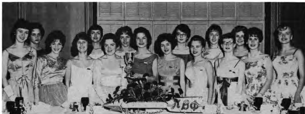
OREGON DELTA—New Chapter members at their initiation banquet.