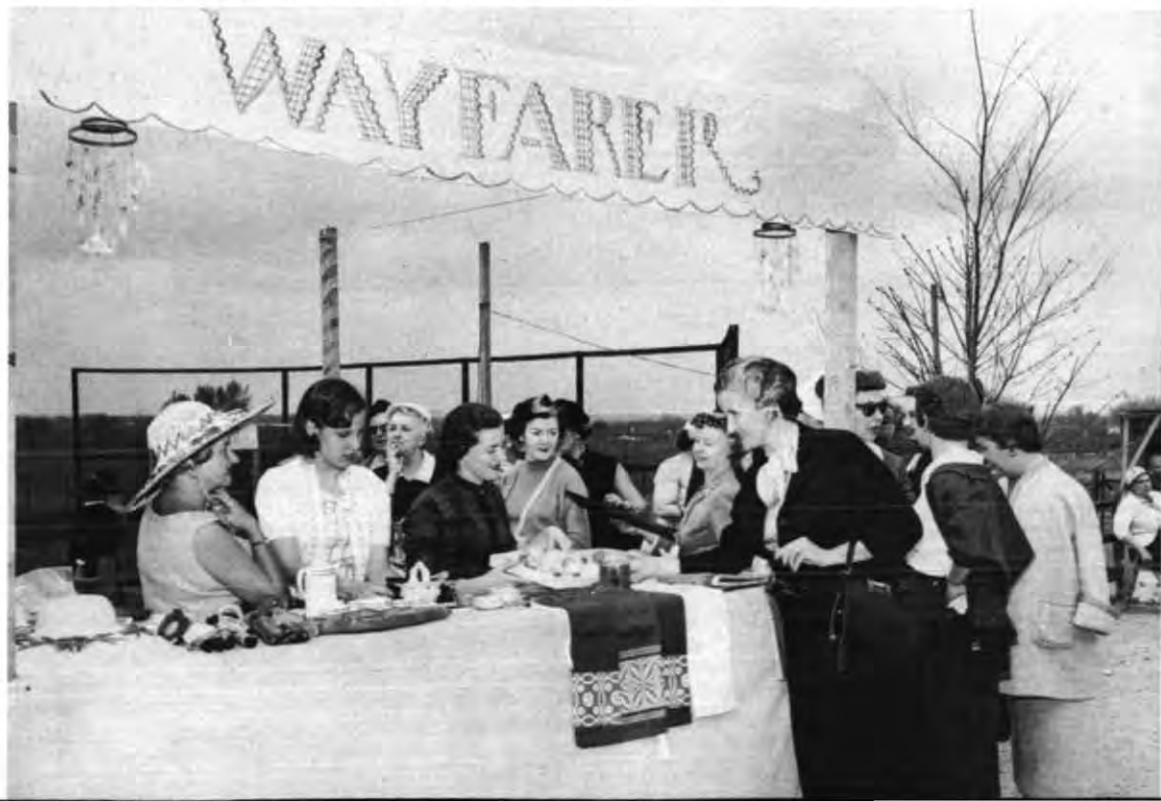
Early arrivals at the Carousel get the best selection at a booth of handmade items.

The net result of all this is a tremendous amount of togetherness for club members and generous gifts for the Settlement School, Emma Harper Turner and Holt House funds as well as for the Youth Counseling Service of St. Louis and the Junior Club's project that provides glasses, shoes and other extras for public school children.