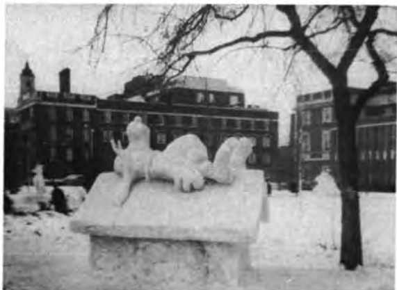
"Snoopy" reclines on his ice house. This ice sculpture brought Alberta Alpha Pi Phis, Delta Upsilon and Phi Delta Theta the Ice Carnival Grand Aggregate prize.