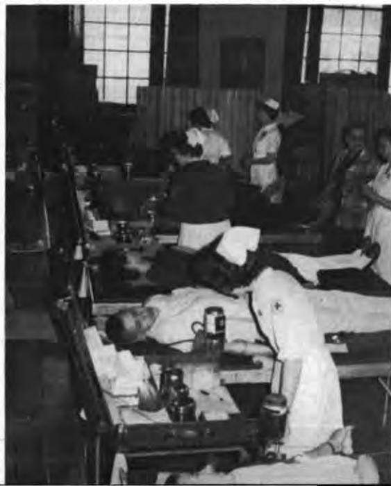
Iowa State University fraternity and sorority members giving blood in Operation Lifeline, II, a Greek Week project.

vide a scholarship for a freshman next year.