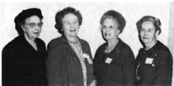
Florida Alpha charter members