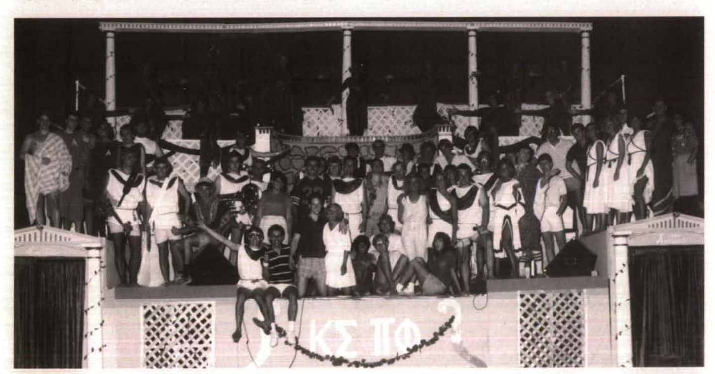
University of Minnesota Pi Phis and Kappa Sigs recreated and reconstructed Pompeii for CARNI '85, and helped earn over $50,000 for the

KANSAS BETA held its second annual Pi Phi Plunge in September. The chapter donates all proceeds of this event to Arrowmont. Last year the chapter raised nearly $1,000 for the national philanthropy.