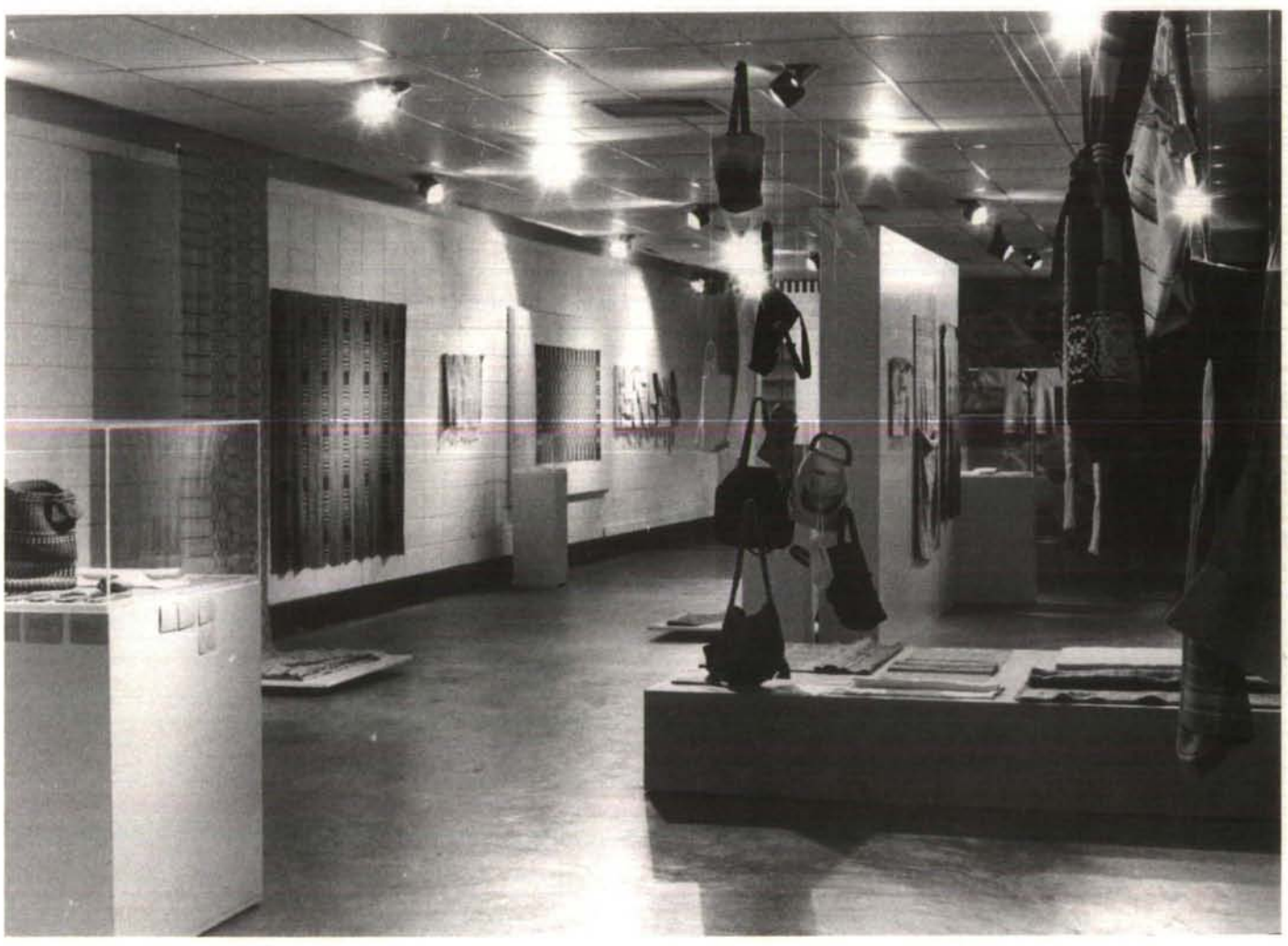
Sixty years since the founding of Arrowcraft was celebrated last spring by exhibiting, in the Arrowmont Gallery, articles woven by Sevier