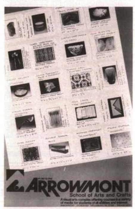
A new Arrowment color poster, 24"×36" is available for purchase. Send $6.00 to Arrowment School of Arts and Crafts, P.O. Box 567, Gatlinburg, TN 37738. This would be perfect for a dorm room or chapter house wall; as a backdrop at an Arrowcraft sale; or in a personal library or art studio.

Make ARROWMONT One Of Your Favorite Philanthropies