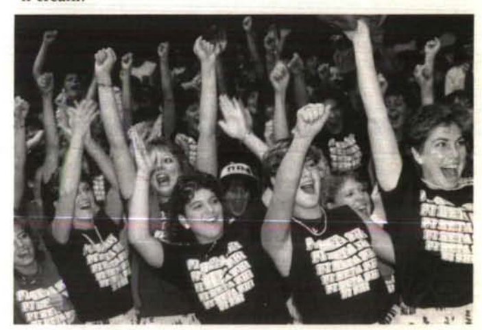
Illinois Theta's Pi Phi Spirit emerged in full force during pre-rush and rush at Bradley. Their spirit dominated much of the Panhellenic scene with four rush counselors, Panhellenic president and treasurer all Pi Phis.

"I'm sorry, but I refuse to be replaced by a carton of cookies 'n cream!"