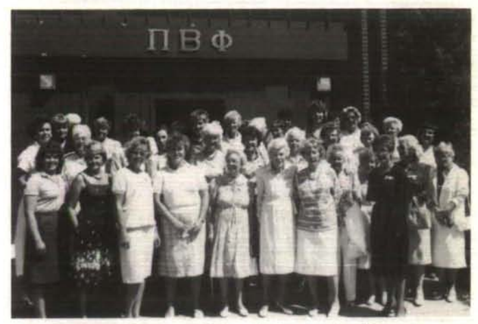
Area alumnae and Montana Alpha collegians gathered for a mortgage burning ceremony in Bozeman in August.

Burning the mortgage, a dream fulfilled, was cause for celebration in August at Montana Alpha, Montana State University. Alumnae and collegians from around the state gathered for luncheon, a tour of the house, and a program highlighting history of the planning and financing that preceded building the house at 1304 South Fifth Avenue in Bozeman.