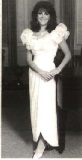
Five of the eight Baylor Beauties chosen this year are Texas Zeta Pi Phis. The decision is based on campus-wide elections, interviews, and a style