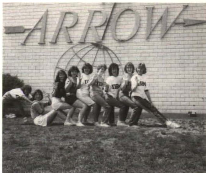
What could be more appropriate than Pi Phis at an Arrow shirt plant? That's what Alabama Alphas figured when they visited the plant in Jasper, AL. Do you suppose they sang that song about the arrow man who wears an Arrow shirt? Wanna bet?