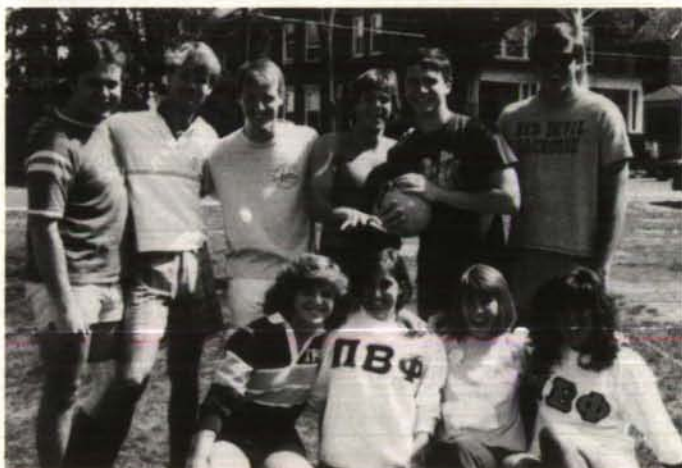
Dickinson College Pi Phis and Kappa Sigs did their part for cancer research with a volleyball marathon.

Pennsylvania Gamma Pi Phis at Dickinson College devoted a weekend of their time last April to raise money for the Cancer Research Institute. With the joint effort of Pi Beta Phi and Kappa Sigma fraternity, $5,000 was raised for the Institute through a volleyball marathon. Between these two Greek organizations, 130 people participated by selling buttons, obtaining monetary pledges and playing several hours worth of volleyball. The marathon continued for 86 consecutive hours, being played on Morgan field during the day and in the Kline Sports Center throughout the night. Several individuals contributed both time and money to make this event a great success.