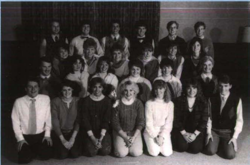
Indiana Gamma teamed with Phi Kappa Psi to place second in Butler's annual Spring Sing in April, sponsored by YMCA. The two houses were also overall winners as they won the spirit competition (ticket sales) and the banner contest. Pi Phi also won the Peer Educators/BACCHUS Alcohol Awareness Award that night.