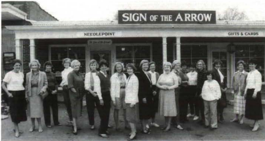
St. Louis Pi Phis celebrate twenty years of success at their not-for-profit shop, the Sign of the Arrow. Founded in 1966, the Sign of the Arrow donated $64,000 to area charities in 1986.