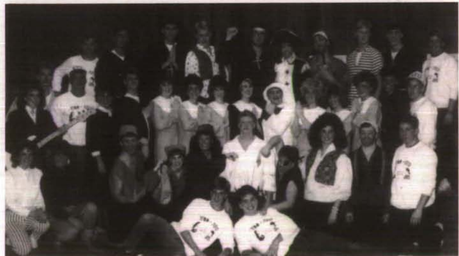
Iowa Gammas, along with the men of ATO, laughed, danced and sang their way to first place at Iowa State's annual Varieties Sweepstakes.