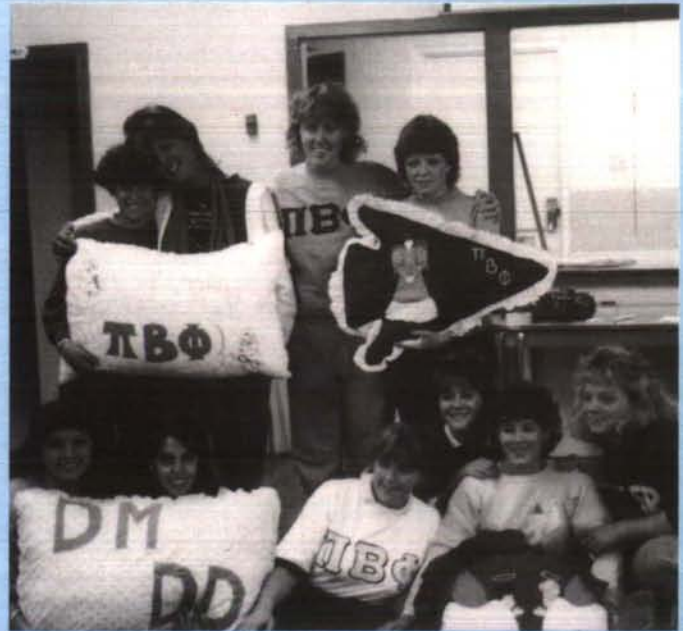
Big Sister pillows are a tradition at New Mexico Beta and are given to pledges at their first retreat. Some of the pledges and their Big Sisters display these special pillows at the spring retreat held in Cloudcroft, N.M.