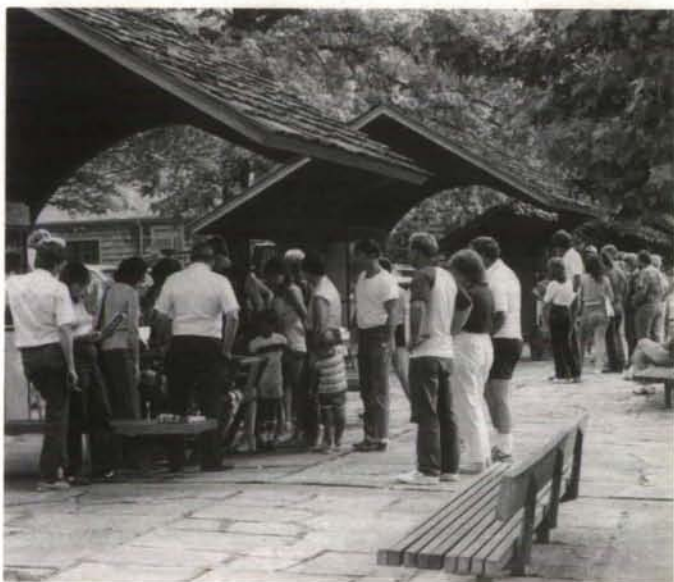
Gatlinburg residents and visitors gather on the mall in front of Arrowmont to watch craft demonstrations given by the school's student assistants.