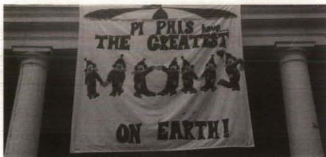
This sign greeted Oklahoma Alpha's moms when they arrived for their special weekend.