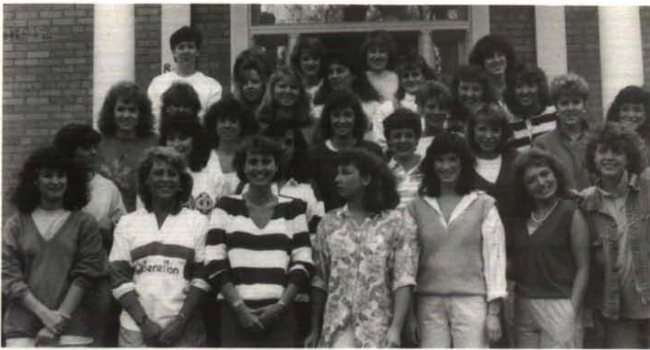
Each year at Founders' Day Idaho Alphas and Washington Betas celebrate together. This year Idaho Alpha traveled the eight miles over the border to the Pi Phi house at Washington State for dinner, a Cooky-Shine and a picture on the front porch of the chapter house.