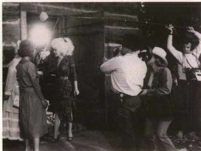
Dolly Parton, center, brought news media out in force as she cut the ribbon opening the historic Ogle Cabin during Homecoming '86.

During 1986, the entire state of Tennessee is celebrating "Homecoming '86," a statewide effort for communities, cities and towns to work together to revive heritage, create special celebrations, develop community projects, and set goals with visions for the future. Since Tennessee is identified with many art forms, artistic expression has played a major role in the Homecoming activities planned in various communities.