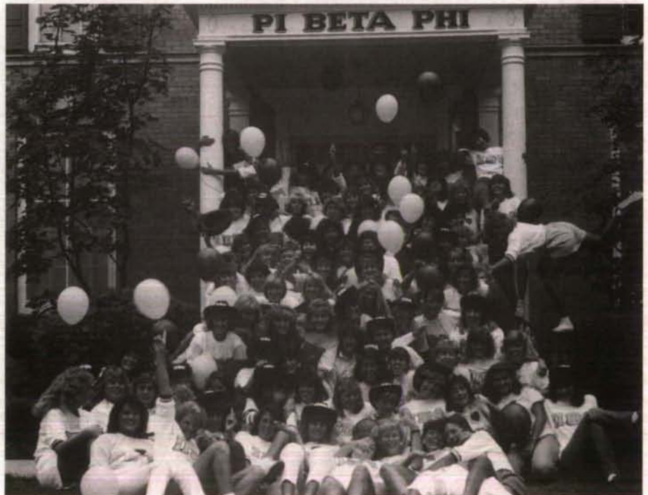
Silly girls? You bet! But it's a natural exuberance that comes because Washington Beta had a record breaking rush and this was pledge day '85. Their chapter house in the background will be 75 years old this year and it's seen a great many enthusiastic, "silly" girls.