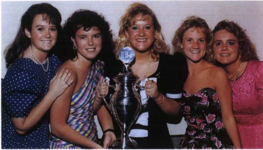
Members of Oklahoma Beta proudly display the Balfour Cup awarded to the most outstanding Pi Phi chapter.