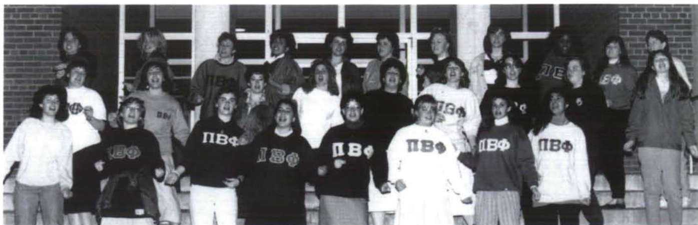
The enthusiasm and ingenuity of New York Gammas did it again! Greek Sing, on the Administration Building steps, kicked off Greek Week 1989 at St. Lawrence University. The annual competition was

won for the third year in a row by the Pi Phis.