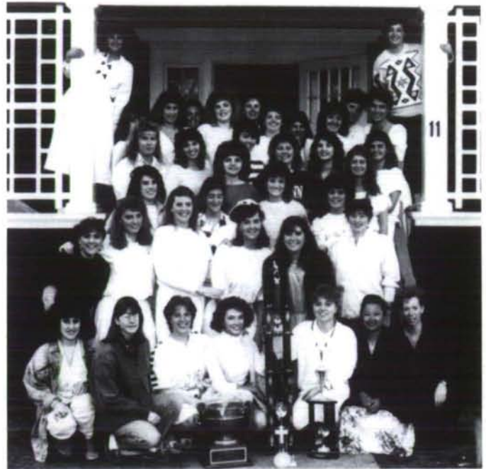
Connecticut Alphas proudly display three trophies collected last spring. Awards included 1st, Greek Week; 2nd, Sigma Chi Derby Days; and Most Improved Chapter GPA.