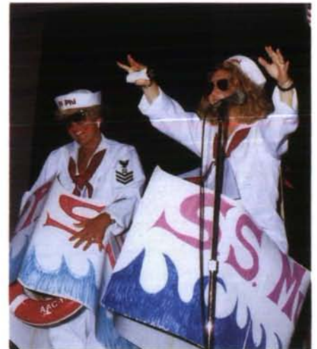
A couple members of the Resolutions Committee being ... the end!