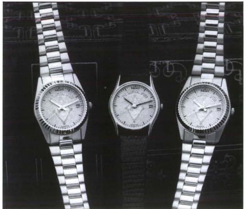
Watches illustrated actual size.