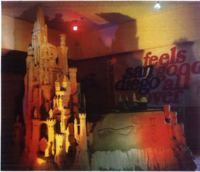
This spectacular sand castle, built especially for the Pi Phis in the Champagne Foyer of the hotel, was dubbed "West Coast Holt House."