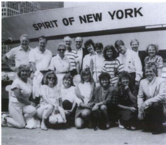
A group of Northern New Jersey Pi Phis, with a husband here and there, ended the club year and celebrated their Beta Province Ideal Club Award by cruising the waters off Lower Manhattan on the "Spirit of New York."