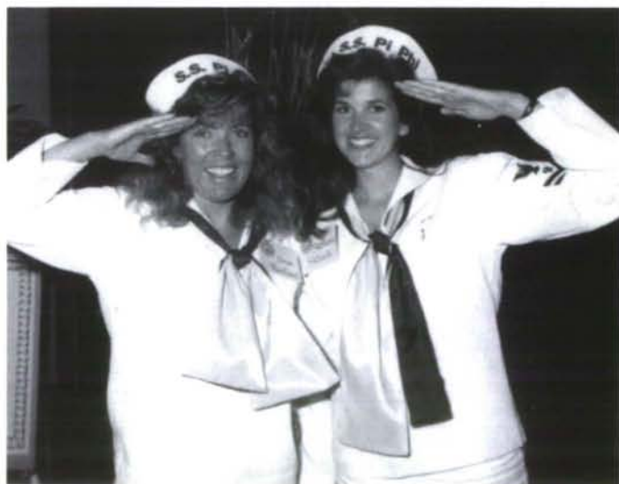
In keeping with the Convention theme, "Charting the Course to a New Decade," these nautical San Diego Pi Phis were among the many greeting Convention arrivals.

Pi Phi Power means Women in Action. Our alumnae and collegians are architects for the future. There are over 160,000 of us now, and even though some observe and support Pi Phi from above, we can continue to make a difference. Let us cling to our ideals, grasp the challenges on the horizon, and lead to a stronger Pi Beta Phi than ever before. Pi Beta Phi can navigate the course to a secure future for Pi Beta Phi and Greek membership everywhere.