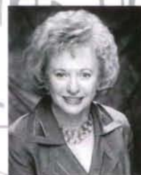
Houston, Texas City Council member

Board of Education member, Westport, Democratic candidate for Connecticut Legislature