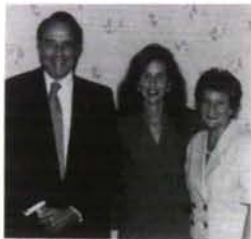
International Finance Analyst at the international law office of Steptoe and Johnson, Florida Beta

"My Pi Phi experience has encouraged leadership, shown the value of the knowledge of those who have preceded and given me the opportunity to make lasting friendships."