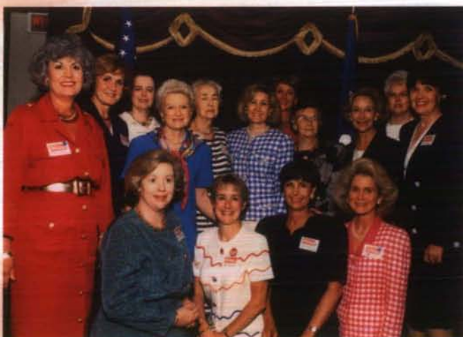
Pi Phis from the state of Texas journeyed to Capitol Hill for the Senator's swearing in ceremony on June 13, 1993.

Her links to build bridges for today's women are just as historically noteworthy. Kay Bailey Hutchison is a woman of firsts: first Republican woman elected to the Texas House; first Republican woman elected to statewide office in Texas; first woman elected Senator in Texas. Though her accomplishments are many, you haven't heard the last from this woman of firsts. One gets the sense that this U.S. Senator is a pioneer of women for women. "I want to be able to pick up the newspaper and read that 'the bottom line earnings of a bank are the best, and the president happens to be a woman,' rather than reading that 'there is a first woman president of the bank.'" She concludes, "I think the best thing that will happen to women is when there are no more 'firsts.'"