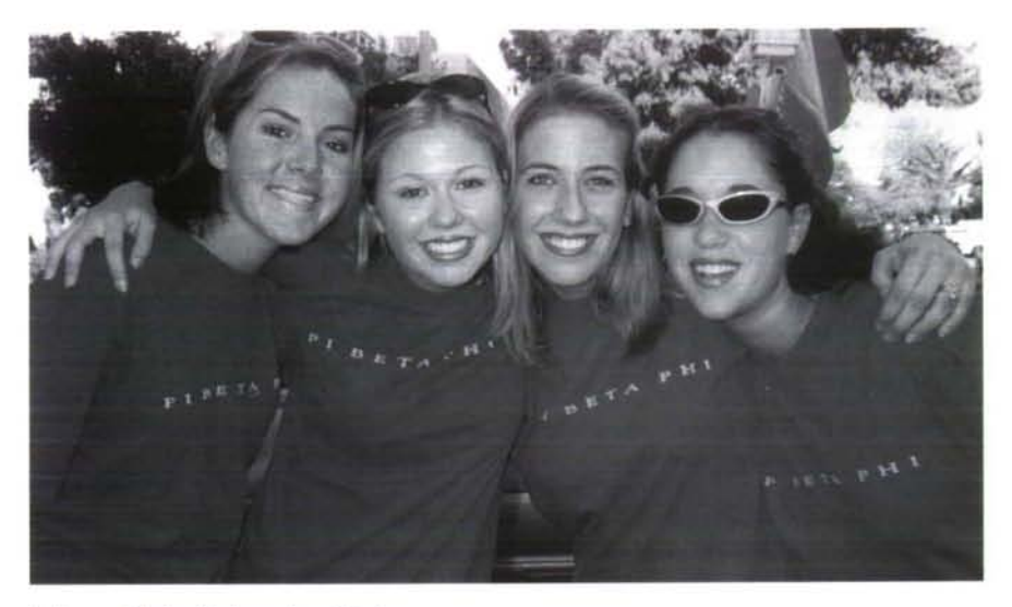
Arizona Alpha, University of Arizona

At New Mexico State University, New Mexico Betas and rushees assemble coloring books and donate them to different schools and charities.