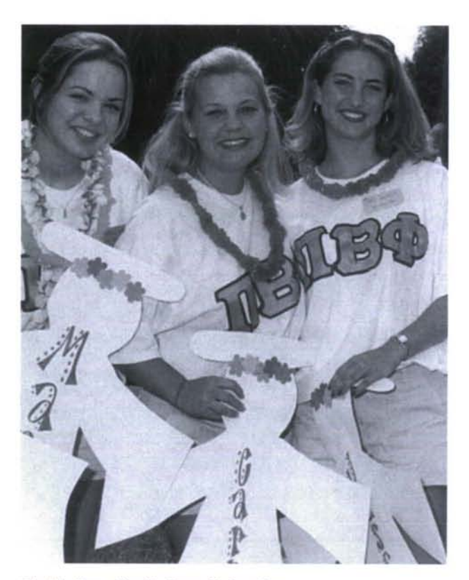
Florida Beta, Florida State University

OHIO THETAS and rushees at Bowling Green State University decorate shapes made of felt. The chapter donates the sets of shapes to local elementary schools in order to help children recognize shapes and learn new words.