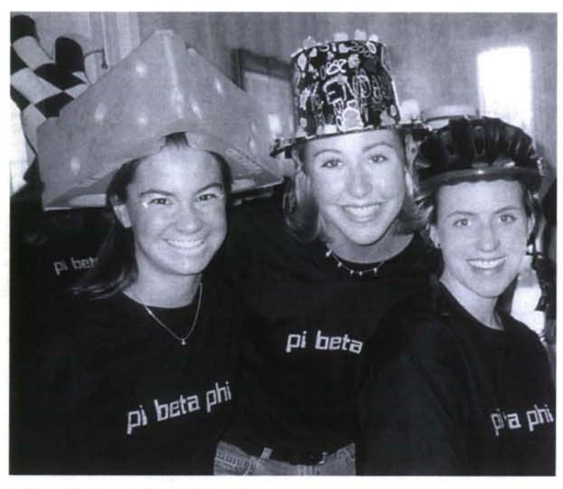
Indiana Epsilon, DePauw University

At Vanderbilt University, TENNESSEE BETAS welcome potential members back on the final round of rush by singing "Speed Thee My Arrow." After visiting with the women, enjoying cake and participating in a candle-lighting ceremony, chapter members again sing the song as potential members exit the house.