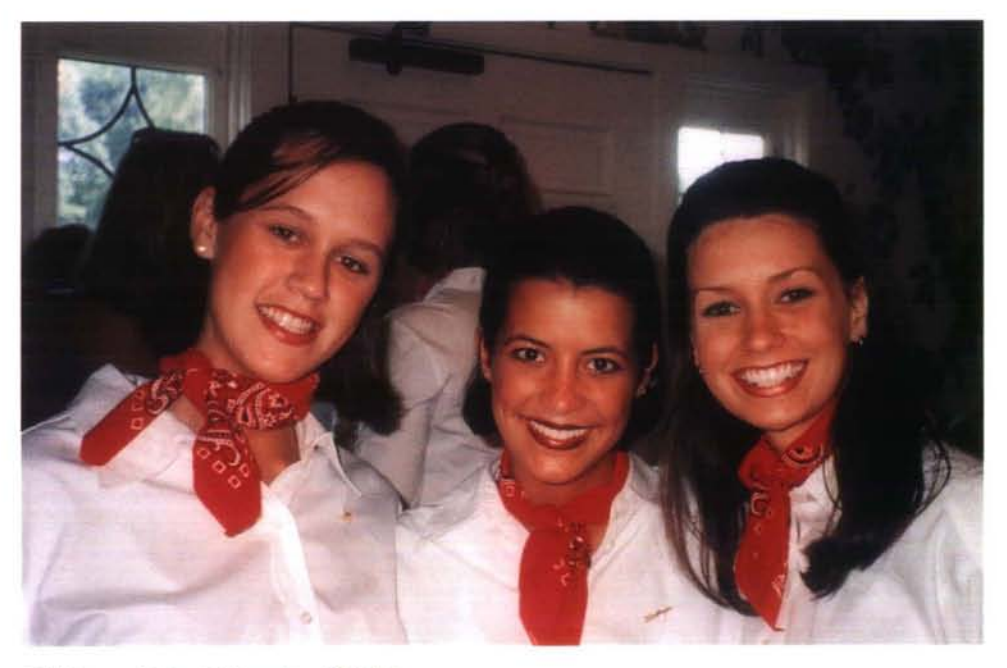
Oklahoma Alpha, University of Oklahoma

Last year more than 1,490 legacies participated in the recruitment process. Thirty-four percent of these women pledged Pi Beta Phi.