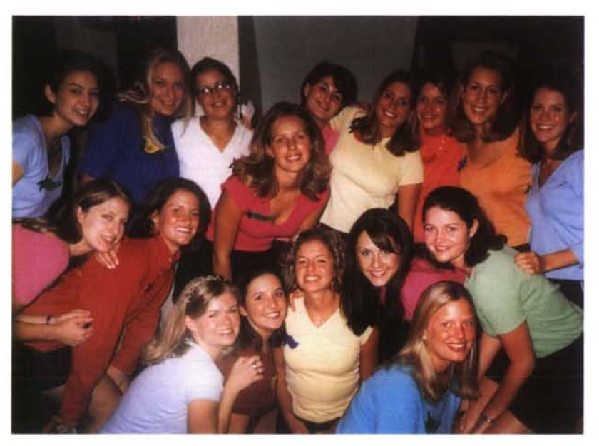
Minnesota Alpha, University of Minnesota