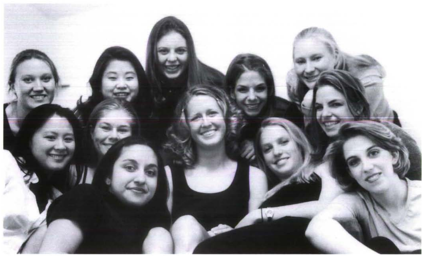
Colorado Delta, Colorado School of Mines