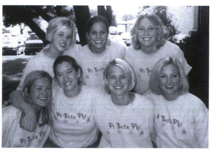
Kansas Beta, Kansas State University

Portraying scenes from different commercials and TV shows including GAP, ESPN's SportsCenter and MTV's Total Request Live helps Tennessee Gammas feature their awards and accomplishments for potential members at the University of Tennessee.