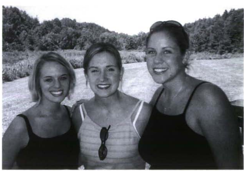
Ohio Alpha, Ohio University

A trip to the principal's office during rush? MISSOURI ALPHAS at the University of Missouri have incorporated this plus other classes in their house-tour day, Pi Phi Prep. For example, a potential member who is sent to the office meets the Chapter President and other chapter officers; if she goes to PE, she finds out the athletic possibilities Pi Phi offers. Also during this day chapter members and rushees make flash cards to use when members volunteer at local elementary schools for Links to Literacy.