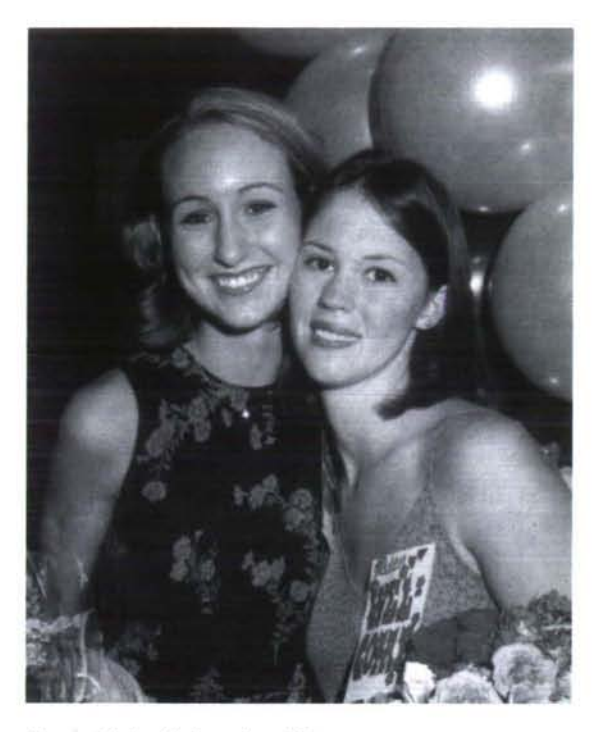
Texas Alpha, University of Texas

At Arizona State University, Arizona Betas show a video during philanthropy day that consists of footage from the various philanthropies the chapter participates in throughout the year.