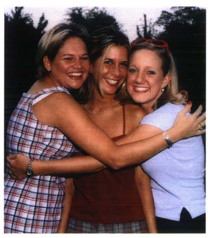
Georgia Alpha, University of Georgia

Someone provided a recommendation for you. Now is the time for you to return that favor to Pi Beta Phi.