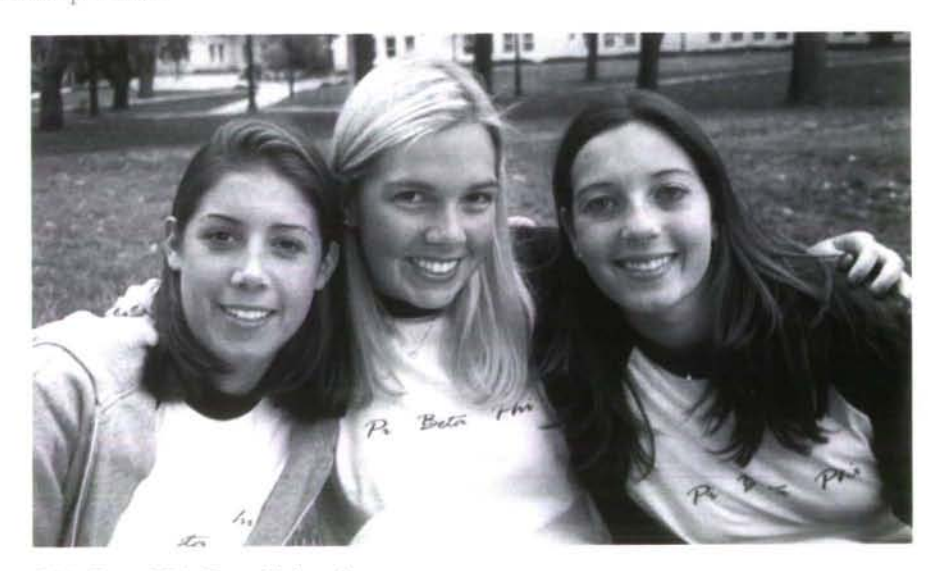
Ohio Beta, Ohio State University

During philanthropy night at the University of Richmond, VIRGINIA ETAS and potential rushees draw and design nursery rhyme books to donate to a local elementary school.