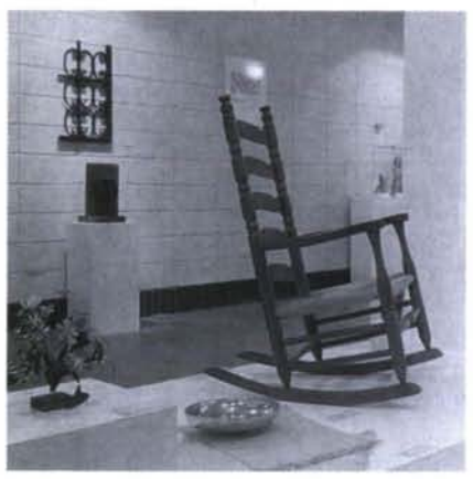
The Southern Highland Craft Guild exhibition, "An Innovative Spirit: The Southern Highland Craft Guild Celebrates 70 Years," was on display in the Arrowmont Main Gallery through May 17.

The Southern Highland Craft Guild exhibition, "An Innovative Spirit: The Southern Highland Craft Guild Celebrates 70 Years," was on view in Arrowmont's Main Gallery through May 17.