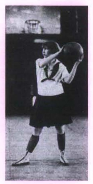
An Illinois Beta basketball player.

ational value. Basketball, volleyball, baseball, tennis and hockey are representative of the type of game that has come into prominence because of this. The interest that has resulted has caused many to take part in athletics outside of class who might never have gotten into the game at all.